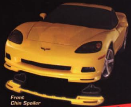
Front Chin Spoiler